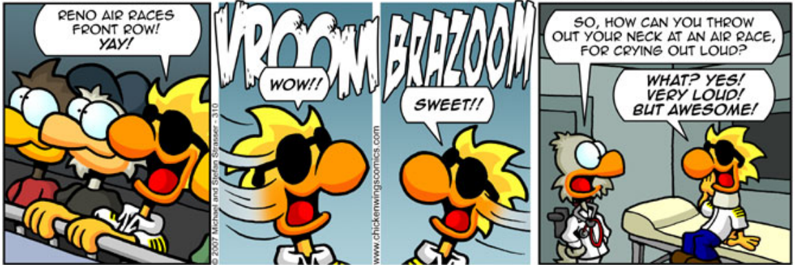
Check out more cartoons at http://www.roost-air.com